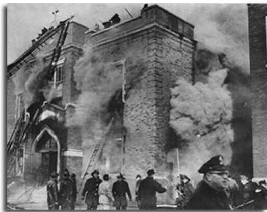
1958 Our Lady of the Angels School Fire